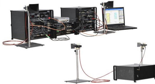
All Telecommunications products