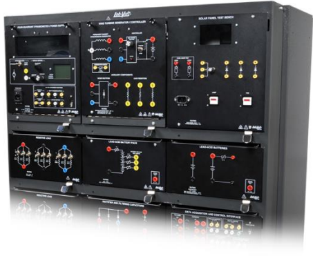
All EMS (8010 and other similar 80x systems)

The following product lines stay as-is*, for now